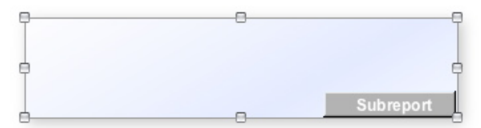
Subreport Template Component

To add a subreport, simply click the Add Shapes button in the toolbar and select the Subreport menu item. This will add an empty subreport template to the document. Simply position and size this to cover the region of the page that you want to be filled with an imported document.